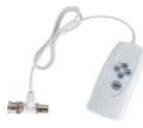
PFM820 UTC Controller