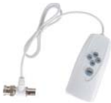
PFM820 UTC Controller