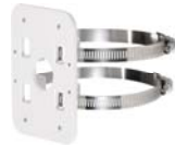
PFA152 Pole mount